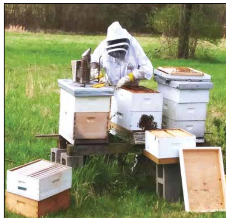
Beehives, like these that belong to Poorhouse Market in Starkville, are worked at least once every one to two weeks during the active, spring growing season, once a month during summer and winter, and again every one to two weeks in the autumn growing season.