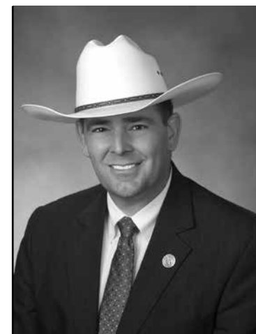
Andy Gipson Commissioner

Applications must be completed and submitted online at www.mdac.ms.gov/whcp . Submitted applications will be evaluated based on the number of acres available for trapping, historical agricultural losses caused by wild hogs on the property and current trapping efforts on the property. A cooperative application is encouraged for small acreage (i.e., adjoining land managers of small parcels should work together to submit one application). Traps will be available for one-month intervals, dependent upon use and success. One trap per 500 – 1,000 acres is recommended, depending on landscape