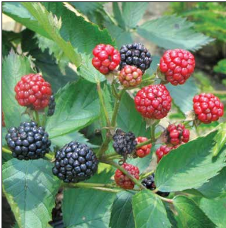
The Sweetie Pie Blackberry produces massive quantities of large, very sweet fruit in late June.

In addition to its excellent fruit quality, Sweetie Pie is resistant to double blossom. Also called rosette, this is a condition caused by fungus