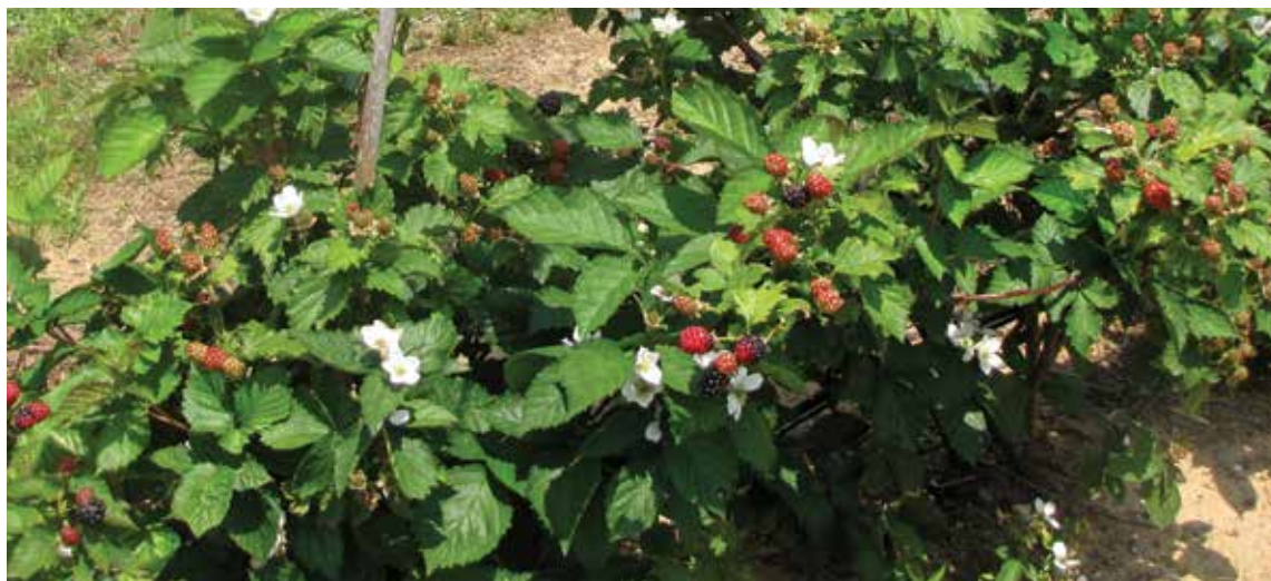
Blackberries such as these Sweet Pie selections thrive in full sun. Consistent irrigation and fertilizer enhance the quality and quantity of fruit.

Sweetie Pie's availability will be limited, but don't let that stop you from growing blackberries this year. Other good thornless selections for Mississippi include Arapaho, Navaho, Ouachita and Natchez.