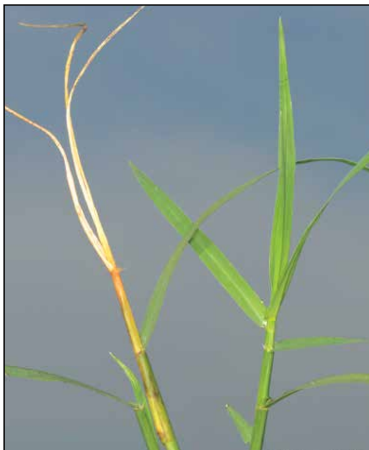
Bermudagrass stem maggots damage the two or three grass blades at the tip of the growing shoot. While light infestations often go unnoticed in hay fields, a heavy infestation can cause a complete yield loss.

"This is vastly different from how treatment decisions are made on