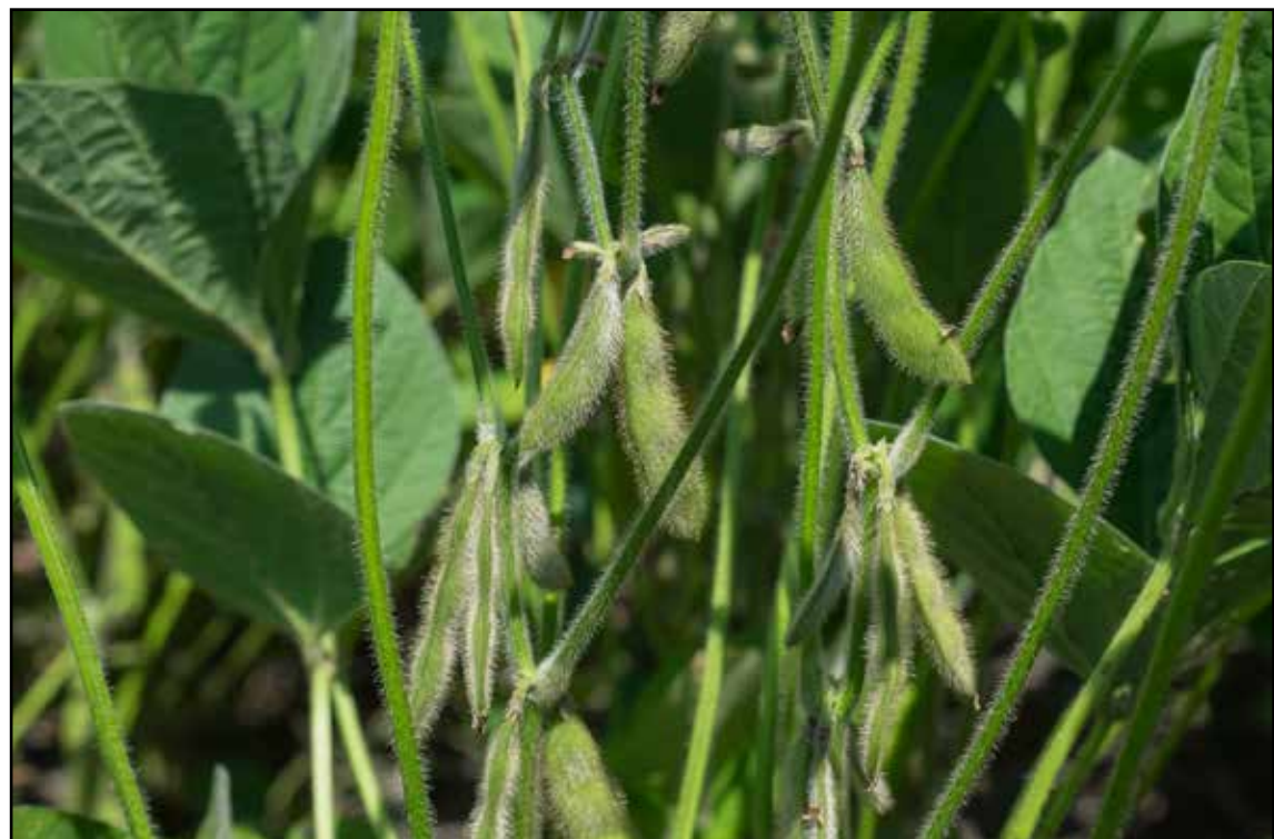
Extreme heat and extended stretches of drought through much of June and July may affect yields.

The USDA's weekly crop progress report estimates 94% of the state's soybean crop has bloomed, with 81% setting pods. Of the eight soybean reproductive stages, full flowering is