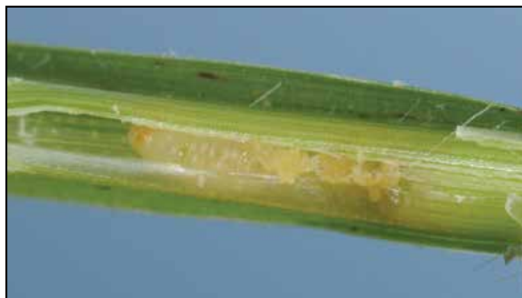
The legless, white larvae of the Bermudagrass stem maggot bore into the growing shoot tips of grass, killing it.