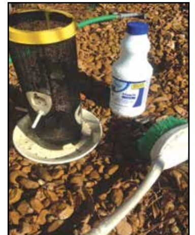
Clean bird feeders outside with warm, soapy water and soak them in a bleach solution of 9 parts water to 1 part bleach for 10 minutes.

While we wait for more information and answers to these important questions regarding the mysterious illness, we should take time to reflect on best management practices related to feeding wild birds in our