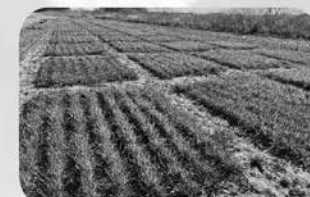
Forage Variety Selection