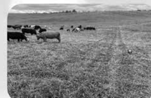
Cool-season Grazing Management

HENRY H. LEVECK RESEARCH FARM (SOUTH FARM) MISSISSIPPI STATE UNIVERSITY CAMPUS, STARKVILLE, MS