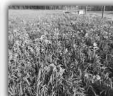
Grazing Cover Crops