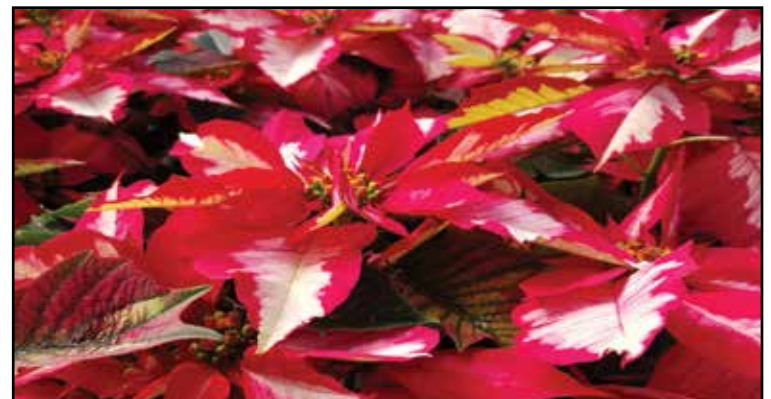
These Ice Punch poinsettias have reverse red bracts and white centers that stand out against the dark-green foliage.

As you shop, look for these and other gorgeous poinsettias at your local garden center to enjoy this holiday season.