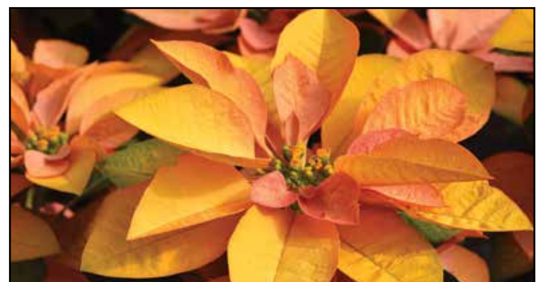
Although red is the standard poinsettia color, it is not the only color naturally available. The rich, golden-yellow and pink of Autumn Leaves poinsettias intensify as the bracts mature.