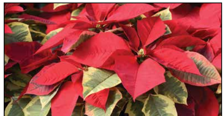
When cared for carefully at home, poinsettias such as this Tapestry can be enjoyed throughout the entire holiday season.