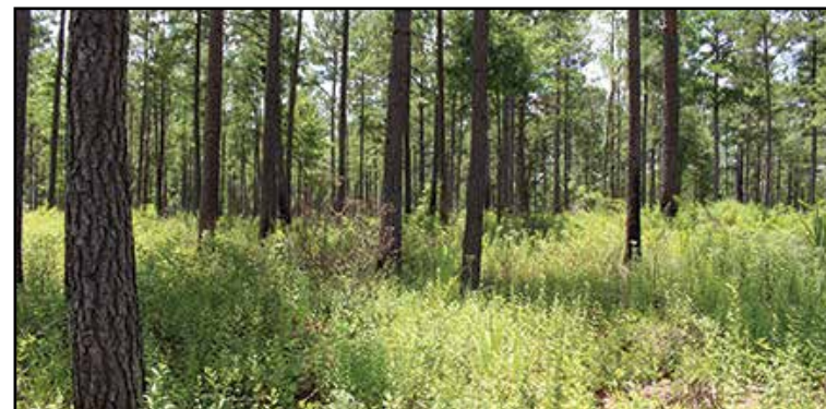
Consider the species and planting density of the new forest. Some sites may be better suited to pine species, like longleaf or shortleaf, that offer different habitat management opportunities than the standard loblolly pine plantation.

The Mississippi Department of Wildlife, Fisheries, and Parks (MDWFP) provides free, on-site help to landowners with wildlife management objectives. These personalized evaluations can be essential to identify limiting factors to wildlife, identify tradeoffs, and plan a path forward. To arrange a visit from a MDWFP biologist, visit www.mdwfp.com/privatelands .