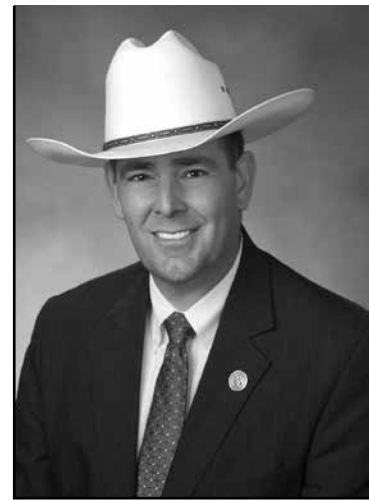
Andy Gipson Commissioner

Disaster loan information and application forms may also be obtained by calling the SBA's Customer Service Center at 800-659-2955 (800-877-8339 for the deaf and hard-of-hearing) or by sending an email to DisasterCustomerService@sba.gov . Loan applications can be download-