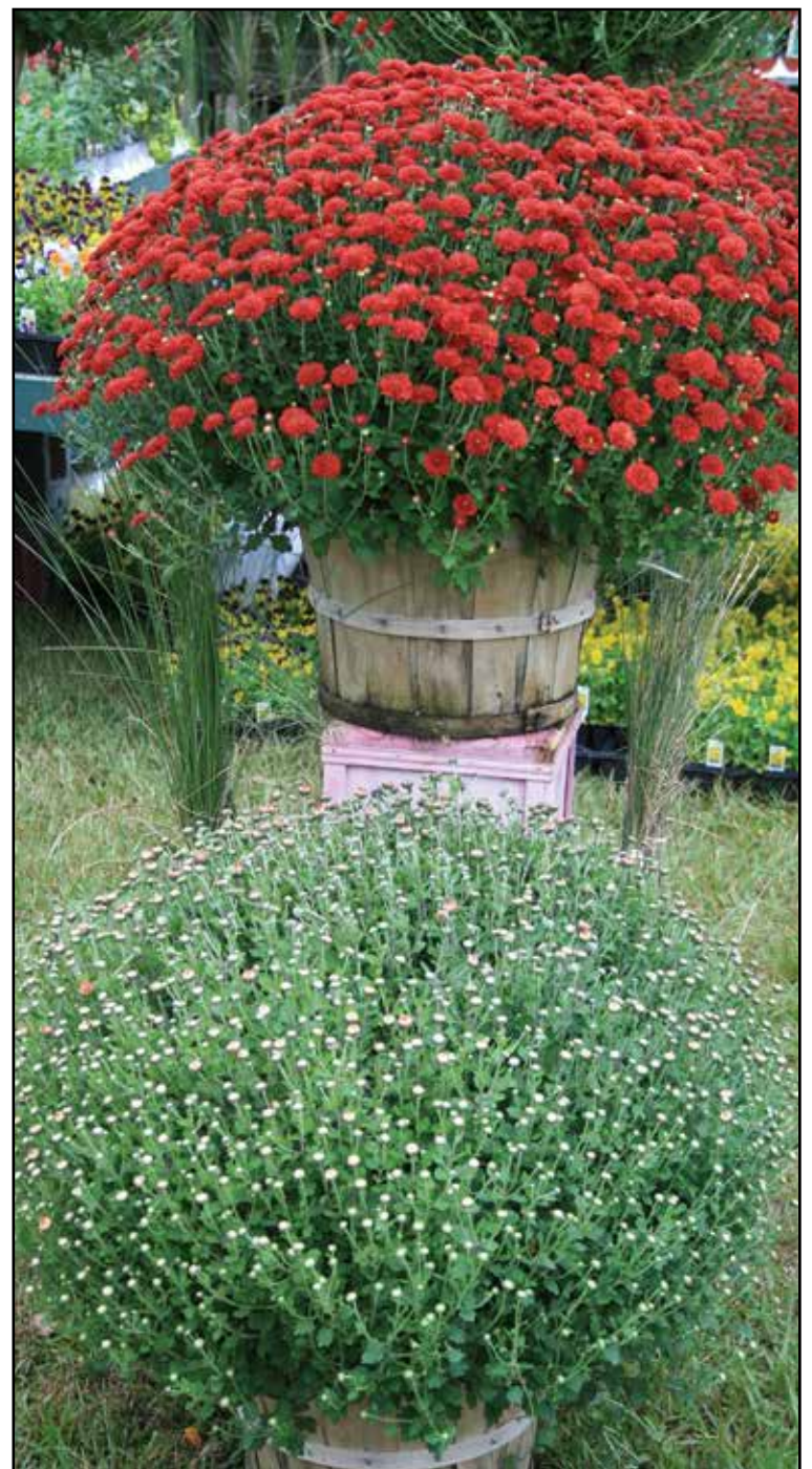
Mums that still have tight buds and are just starting to show color provide a longer, more prolonged landscape show in the fall.

Try planting them in a raised bed for the better soil drainage in the winter months. After the first freeze, cut the stems back and mulch with a layer of pine straw. Next spring, pull the pine straw away and see what emerges from a long winter's rest.