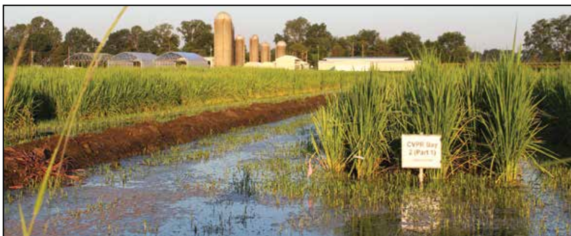
Rice variety trial plots await harvest at the Delta Research and Extension Center in Stoneville, Mississippi, August 6, 2020.