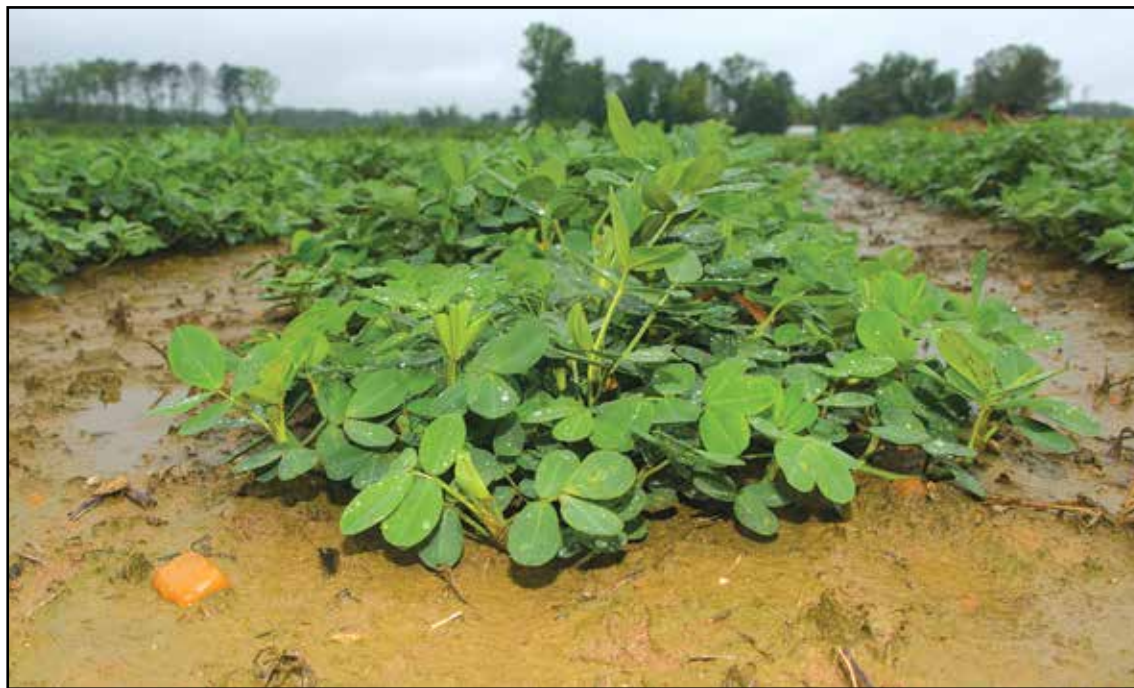
Rainfall soaks into peanut rows on July 2, 2020, in Monroe County, Mississippi.

520,000 acres, down 160,000 acres from March planting intentions. Corn acreage is also down, with 550,000 acres planted instead of the initially projected 710,000.