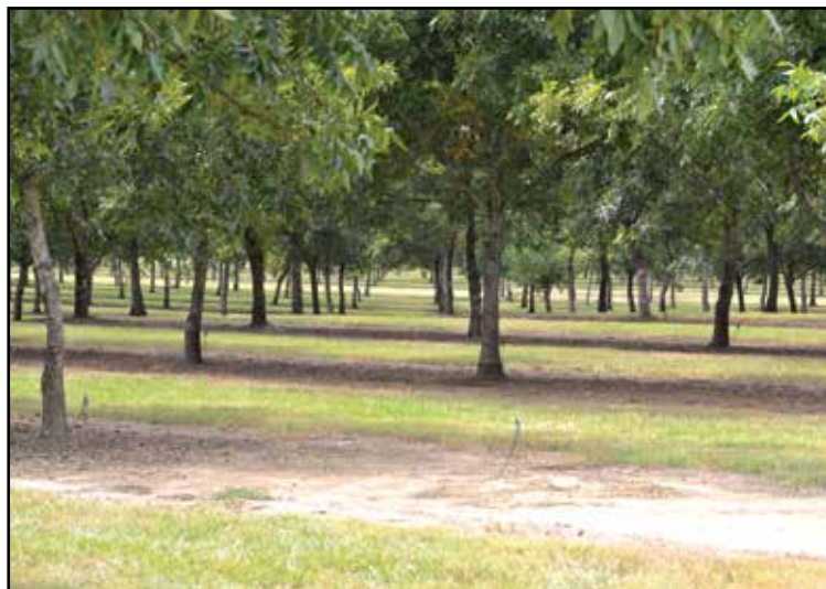
Pecan producers with irrigated orchards, such as some trees at Bass Pecan Company in Raymond, Mississippi, fared better during the late-summer drought this year and will have better quality nuts.