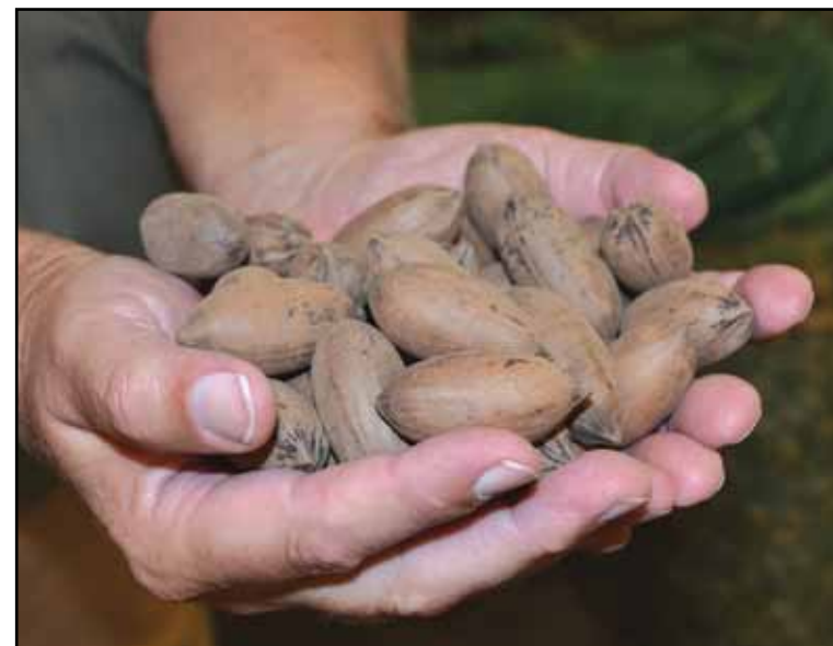
Ample rains during the 2017 growing season helped Mississippi pecans grow large in time for holiday treats and meals. These pecans were harvested in the Raymond, Mississippi, area.

Draughn said wholesale prices for unshelled nuts range from lows of 80 cents to $3.50 per pound, depending on the size and quality.