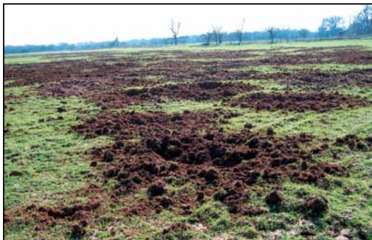
Damaged wheat fields caused by wild hogs.