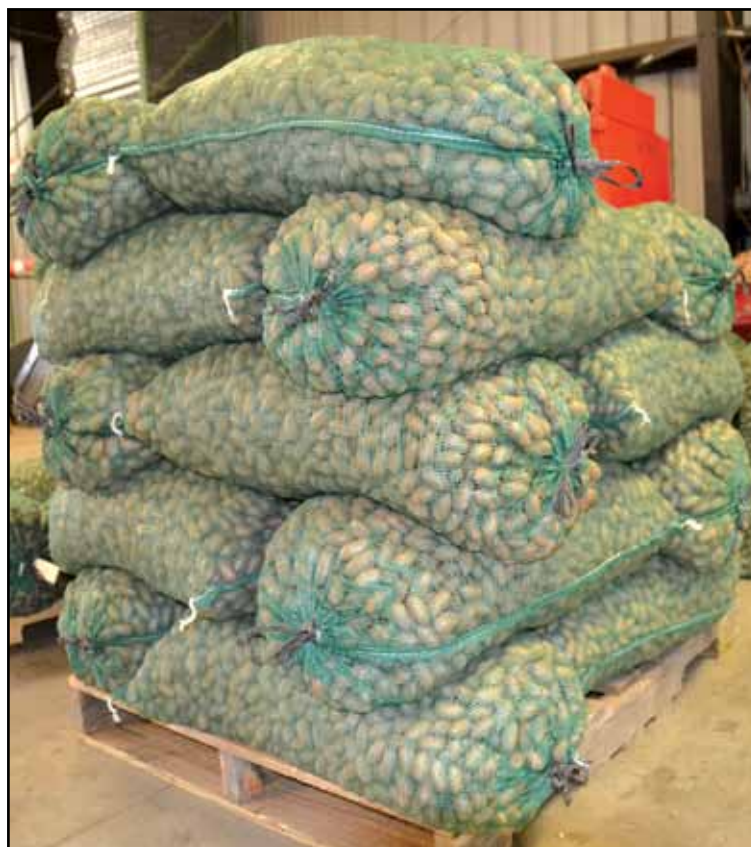
These 50-pound bags of pecans are part of the bumper crop being harvested in the Raymond, Mississippi, area.

"Many orchards across the state have been neglected. In some cases, new owners or managers want to know how to return them to production. Renovating takes a lot of effort and may depend on the varieties and density of the existing orchard,"