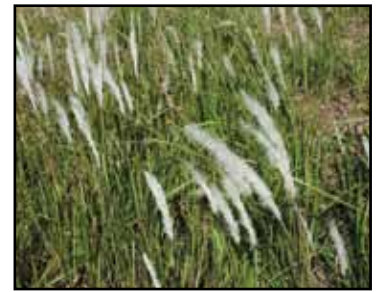
Cogongrass is a tall (2-5 ft.) perennial grass with lime-green foliage. The leaf blades have a mid-vein which is clearly offset to one side, and serrated (toothed) edges. The seed heads that appear in late spring or early summer are fuzzy, white, and plume-like.

The need to combat Cogongrass in a timely manner is important because it can quickly impact the envi-