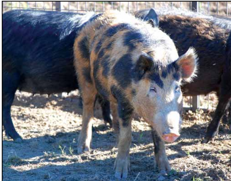
Landowners affected by wild hog damage often set traps to capture these pests before they do more harm.

"On our WMAs, wild hogs can only be taken incidentally. For example, wild hogs can be taken during small-game season, but only