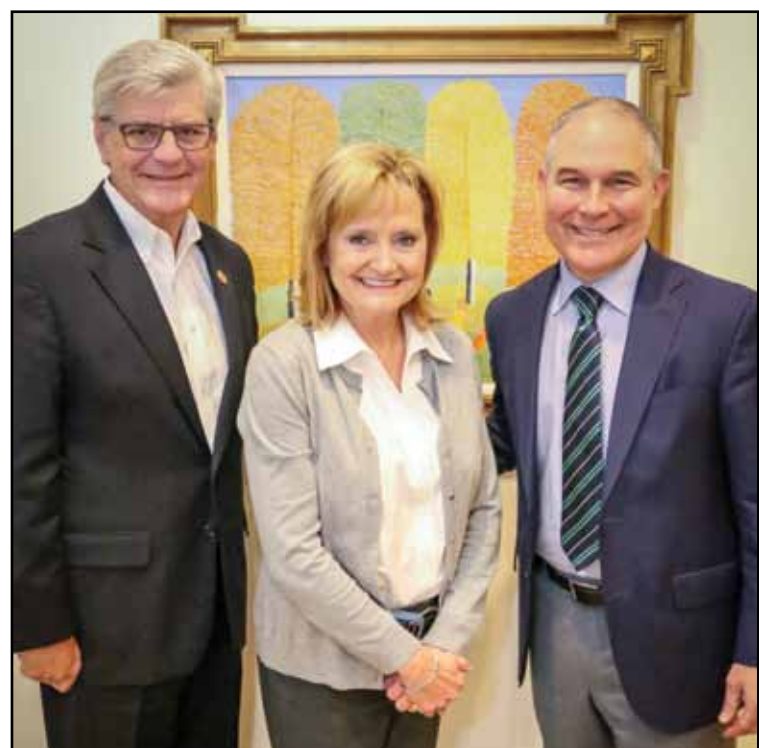
Governor Phil Bryant and Commissioner Cindy Hyde-Smith look forward to working with EPA Administrator Scott Pruitt on "waters of the U.S."

On October 12, 2017, EPA Administrator Scott Pruitt visited Mississippi and met with Governor Phil Bryant, Commissioner of Agriculture and Commerce Cindy Hyde-Smith, farmers, and other state leaders to discuss ways to strengthen partnerships with EPA. One major topic of discussion during Administrator Pruitt's visit was "waters of the U.S." Administrator Pruitt ensured that the EPA will look at Mississippi as a partner, not an adversary. Mississippi leaders look forward to working with the EPA and the Army Corps of Engineers through the process of reevaluating and redefining "waters of the U.S." Stakeholders will now have a voice regarding the CWA and "waters of the U.S."