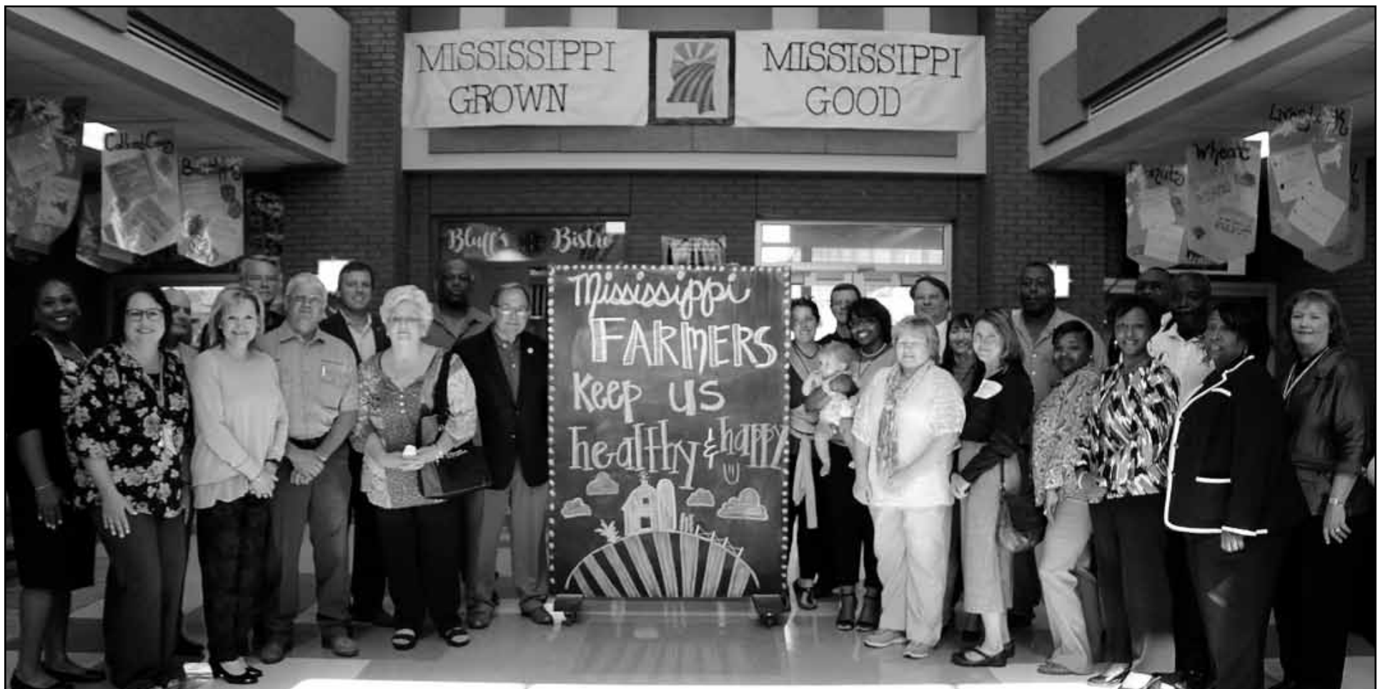
Highland Bluff Elementary School in Brandon welcomed farmers and state and local officials to their school during Mississippi Farm to School Week. This celebration, a collaboration of the MDAC the MDE and the Rankin County School District, gave students the opportunity to meet the farmers that grow many of the fruits and vegetables served in their cafeteria throughout the school year.

The MDAC and the MDE participated in other farm to school celebrations throughout the state during Mississippi Farm to School Week. Representatives from both agencies attended special events at North Bay Elementary in Biloxi.