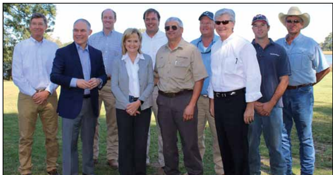
On October 12, 2017, EPA Administrator Scott Pruitt visited Mississippi and met with Governor Phil Bryant, Commissioner of Agriculture and Commerce Cindy Hyde-Smith, farmers, and other state leaders to discuss ways to strengthen partnerships with EPA.