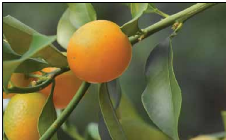
Kumquats produce fruit in astonishing numbers, but due to their small size, their weight does not threaten even small trees. They are perhaps the most cold tolerant of the citruses.