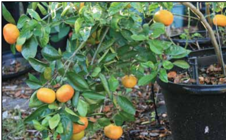
Satsuma oranges are winter favorites that grow well in Mississippi. Their heavy fruit load can overwhelm small trees.