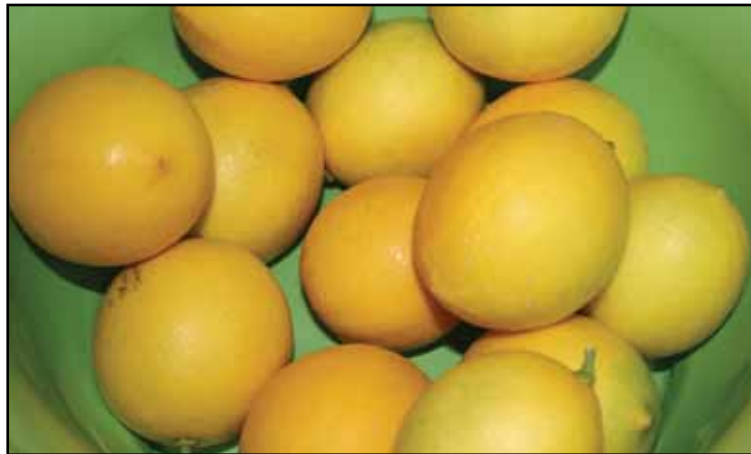
Meyer lemons, a cross between a lemon and an orange, are thin-skinned and sweet. They can be grown in Mississippi landscapes.

For now, I'll just have to be satisfied with the visions of homemade limoncello while I wait out the rest of the summer in air conditioning.