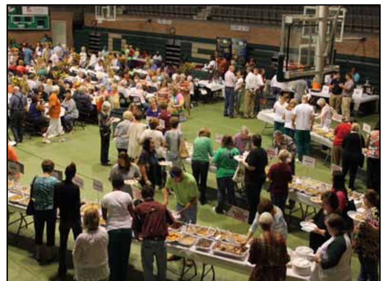
Attendees of the 27th annual Rice Tasting Luncheon can sample more than 300 rice dishes during the event September 15, 2017, at the Delta State University Walter Sillers Coliseum in Cleveland. The luncheon is held in conjunction with National Rice Month and highlights Mississippi's 17 rice-producing counties.

Admission is $5 per person. Tickets can be purchased at the door or in advance from Farm Bureau offices or from MSU Extension offices in the Delta. For more information, call the Extension office in Bolivar County at 662-843-8371.