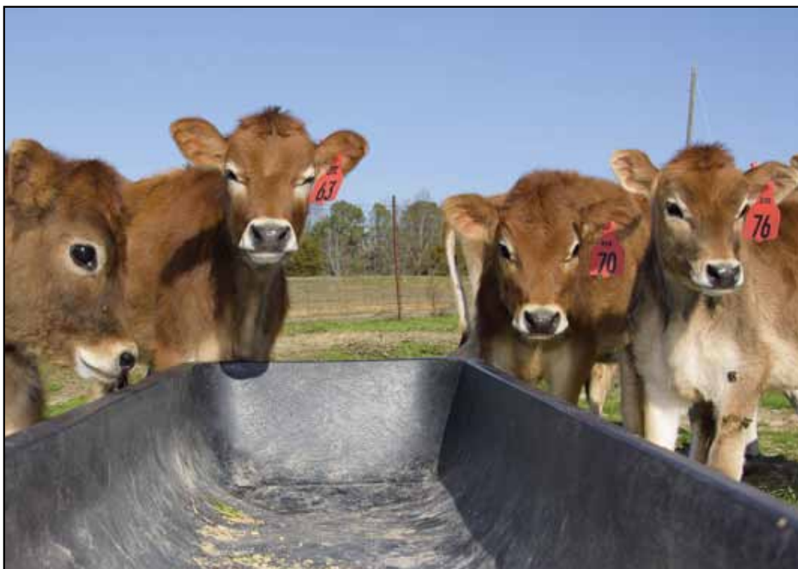
Jersey cows huddle outside the Joe Bearden Dairy Research Center in Sessums, Mississippi, in February. Primarily due to a lower number of dairy cows, the state's milk production in the first quarter of 2017 was down from the previous year.