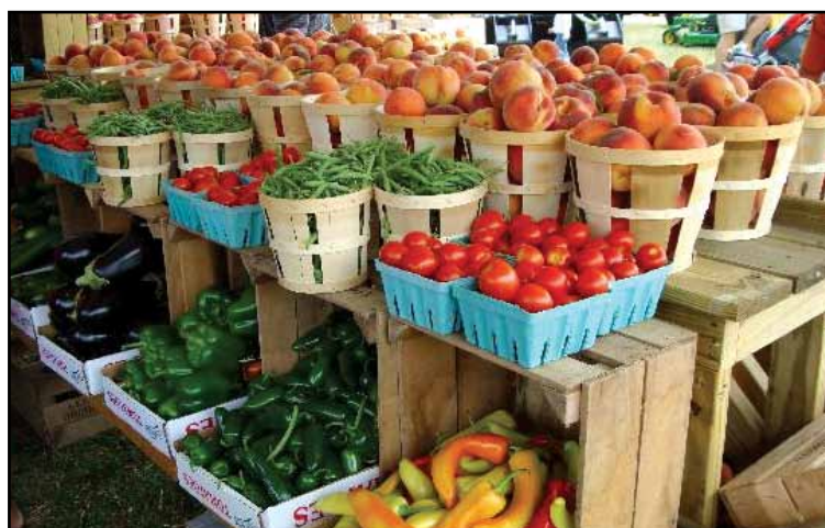
Early spring temperatures allowed some truck crops producers to plant their fruit and vegetable crops a little early this year.

"Everything is going well," he said. "Tomatoes grown in greenhouses or high tunnels are ready now. We project watermelons will be ready around mid- to late June, and field tomatoes should be ready to start coming off the vine around