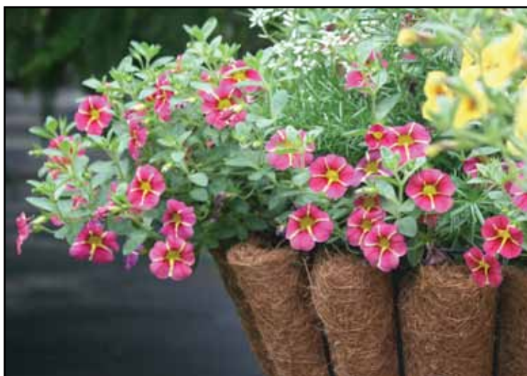
Superbells Supertunias come in a wide range of colors. They look great massed in landscape beds or planted in containers and hanging baskets, as shown by these Cherry Stars planted with bright and cheerful Saffrons.