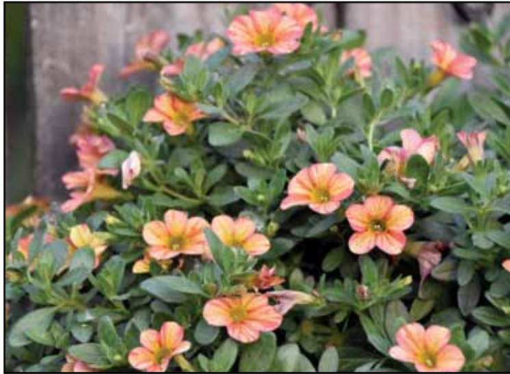
Superbells Supertunias such as these Tropical Sunrise selections have tremendous growth potential and funnel-shaped flowers that add pizzazz to the landscape.

Start making plans now to include Superbells in your garden and landscape this summer.