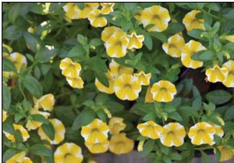
Superbells like these Lemon Slice Supertunias are tough plants with good summer heat tolerance.