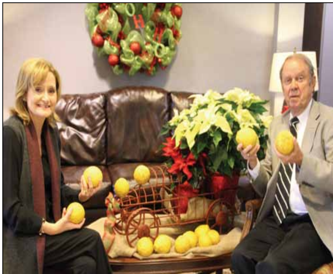
Commissioner of Agriculture and Commerce Cindy Hyde-Smith accepts some Mississippi grown Meyer lemons from Commissioner of Insurance and State Fire Marshal Mike Chaney.