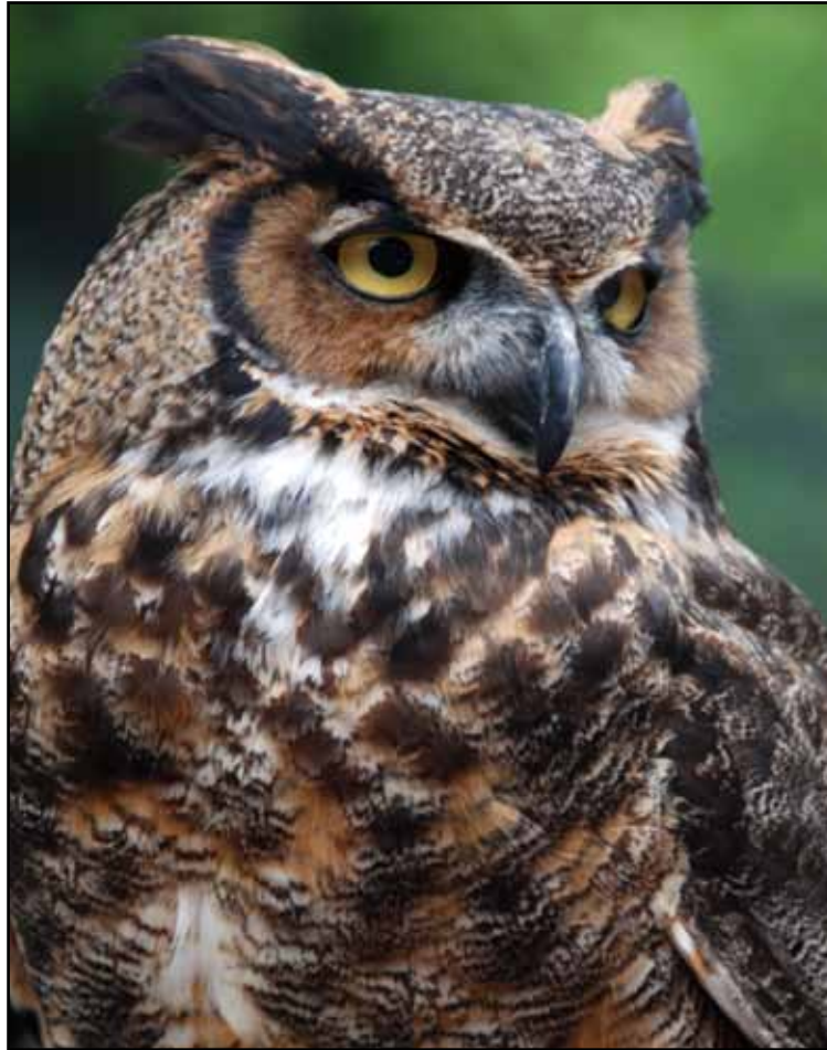
The great horned owl is one of the larger owls in Mississippi. These owls feed on rabbits, skunks and even other owls.

Owls are adapted to live in diverse habitats on every continent except Antarctica. Beautiful snowy owls, such as Hedwig from the Harry Potter books, live in the arctic tundra, not at Hogwarts School of Witchcraft and Wizardry. Their white