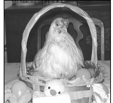
Happy Easter from the Woof & Woolly Farm in Macon, MS.