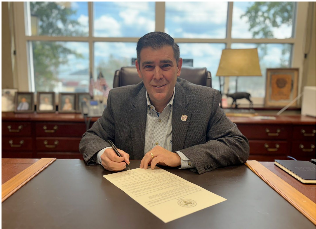
Photo and proclamation attached.