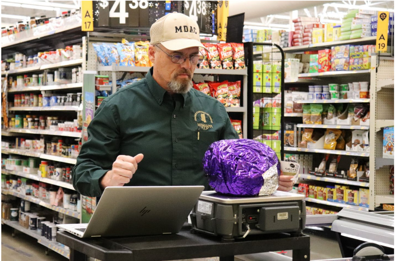
MDAC Consumer Protection inspector a conducting a package check inspection for proper weight.