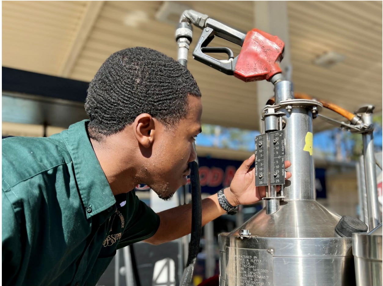
MDAC Petroleum inspector verifies the accuracy of a gas pump.