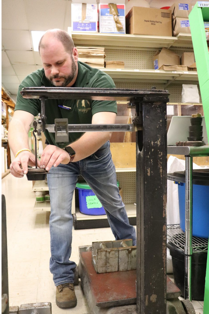
MDAC Weights and Measures inspector testing bulk product scales for accuracy.