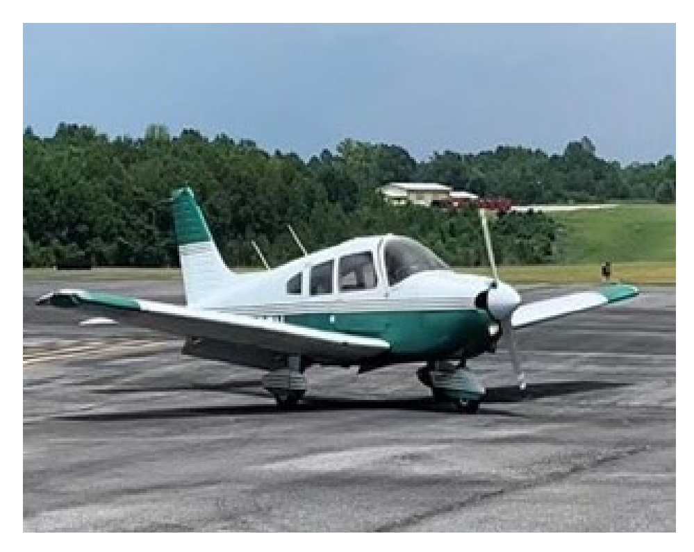
A 1976 Piper Cub Airplane was reported stolen from the Indianola Airport, and recently has been linked to a MALTB investigation. The plane is still missing.