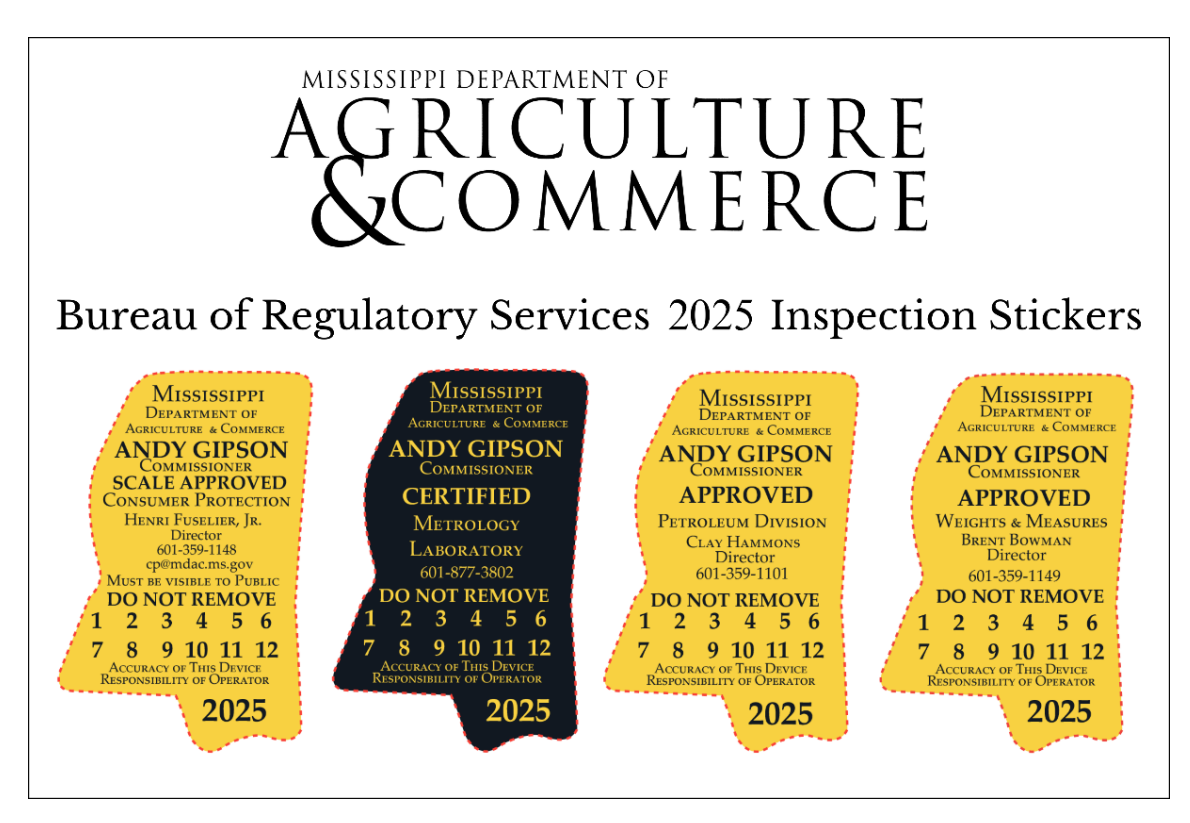
The 2025 MDAC inspection stickers feature USM's black and gold.