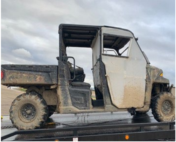
The Mississippi Agriculture and Livestock Theft Bureau recovered a stolen John Deere 3039R tractor (left) stolen out of Washington County, Mississippi, and a Polaris 1000 side-by-side (right) stolen out of Ashley County, Arkansas, this week. The agricultural equipment, valued at a combined $82,300, was located and recovered in Sunflower County, Mississippi.