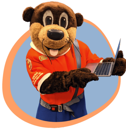
Seat Belt & Booster Seat Safety Program mascot Ollie Otter

A student wears a bandanna provided by Southern AgCredit at Kids Day 2023.