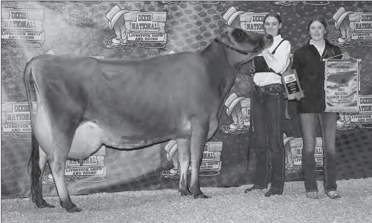
2023 GRAND CHAMPION COMMERCIAL DAIRY COW