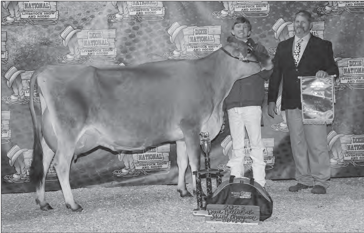
2023 GRAND CHAMPION JERSEY & SUPREME CHAMPION DAIRY FEMALE