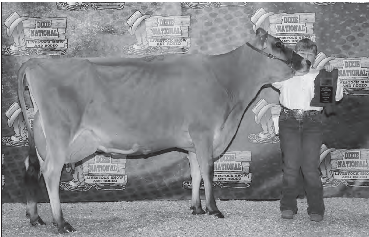
2023 SUPREME DAIRY EXHIBITOR

$1,500 Scholarship provided by Dixie National Sale of Junior Champions