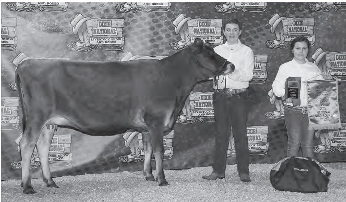
2023 GRAND CHAMPION COMMERCIAL DAIRY HEIFER

Presented by Dixie National Booster Club