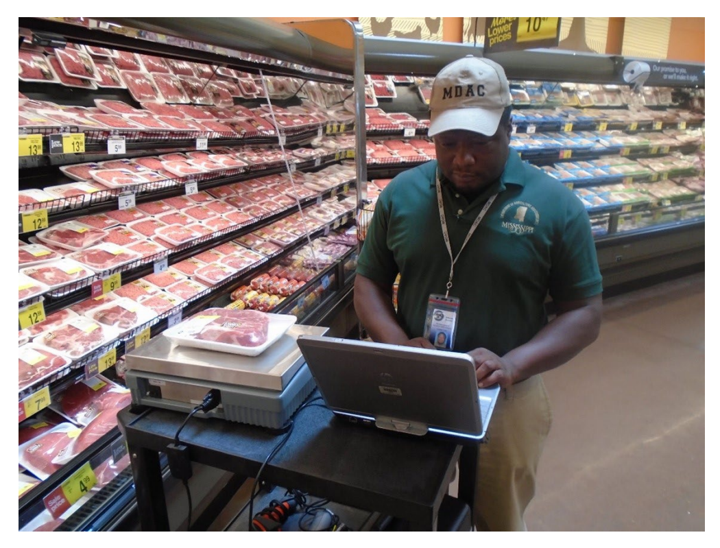
MDAC Consumer Protection inspector checks packaged meat weights.