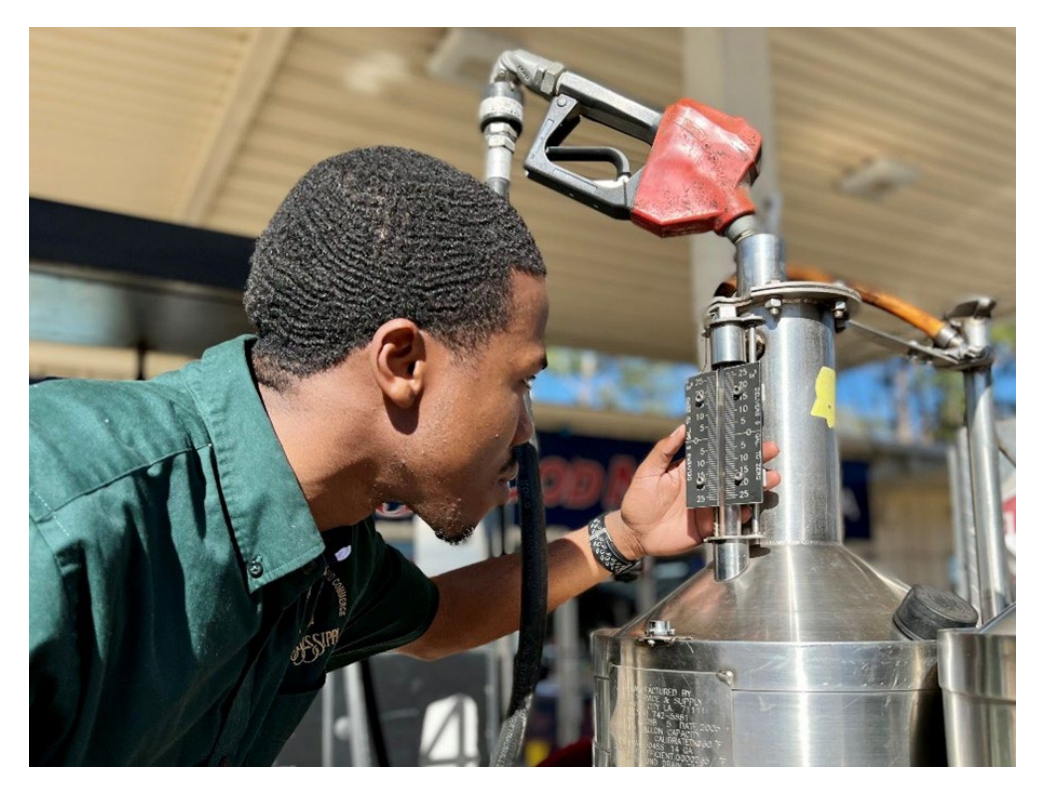
MDAC Petroleum inspector verifies the accuracy of a gas pump.